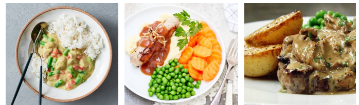
Thai green chicken curry · Pork sausage · Pork steak Diane

One of the major changes is that we are removing Flagstaff as one of our providers & we are introducing a new supplier: Gourmet Meals. We have taste tested a lot of their meals & are very happy with them.