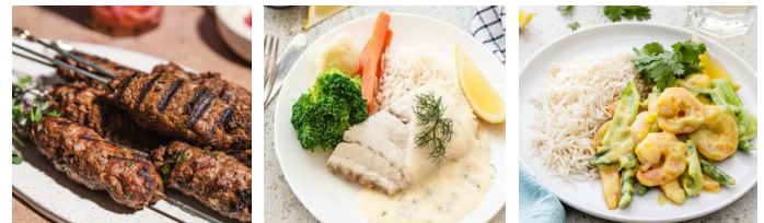
Beef kebab · Barramundi w/lemon butter · Curry prawns

After a lot of trouble sourcing vegetarian & vegan meal options, we are very pleased to announce that Gourmet Meals have an exciting variety available. In addition, the proportion of Gluten Free options on our menu will increase significantly. We encourage you all to sample the vegetarian, vegan & Gluten Free meals, even if that is not necessarily your usual choice - they are definitely worth it!