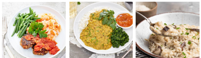
Brown rice patties · Coconut dahl · Mushroom risotto

I am personally very happy to announce the return of some of our old favourites that we had previously removed from the menu due to increased prices. You will see the return of the Braised Steak w/Onion Gravy, Barramundi w/Lemon Butter, Roast Turkey & the mini-sized Crumbed Fish w/Potato Bake. In order to accommodate these items we have introduced a two-tiered pricing structure. There is a small price increase across the board, plus premium prices for those main meals, mini meals & desserts that our suppliers charge more for. You told us you would be happy to pay more for these & we listened!