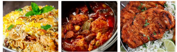
Chicken biryani · Chicken chorizo stew · Tandoori chicken

You will be pleased to hear that we have just about finalised our new menu which will be available to order from after July 1.