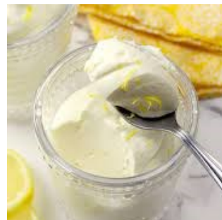
Lemon cheesecake mousse