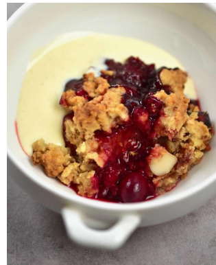
Berry crumble w/custard