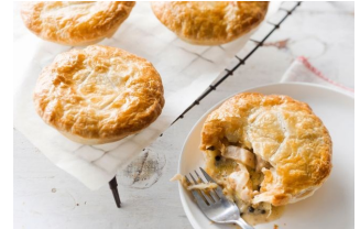
Chicken & tarragon pie