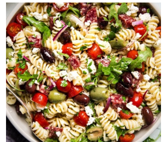
Mediterranean pasta salad